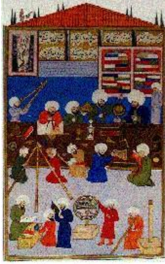
Rasathanedeki gözlem çalışmalarını gösteren bir minyatür.

In 1500's in Europe, Copernicus was working on Astronomy and he found the first heliocentric model of our solar system. After these he got so many questions about earth's movement and gravity etc. Kepler, Galileo and Newton worked on these questions and found the answers.